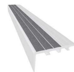
C5160 Grey slip resistant silicon carbide