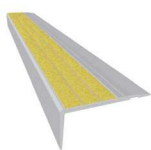
F4-150 Yellow slip resistant silicon carbide

It can also be fitted over steps with an industrial or commercial type carpet (with no underlay) and up to 6mm thick.