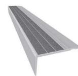
F4-160 Grey slip resistant silicon carbide